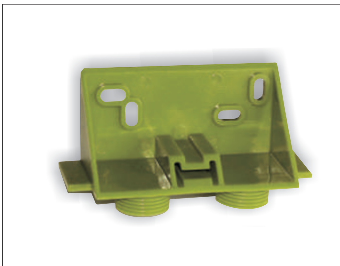
Item no. 1-005912 Item des. Pre-assembly template Standard

The installation procedure on site can be simplified using the pre-assembly template with a wall bracket. Distances from the wall and mounting dimensions can be prepared without installing the radiator.